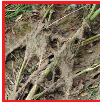
Didymo or rock snot (alga) ( Didymosphenia geminata )