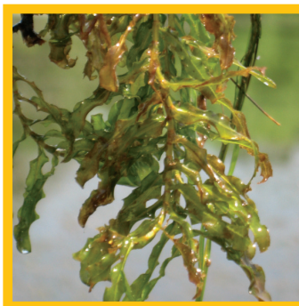
Curly-leaf pondweed ( Potamogeton crispus )