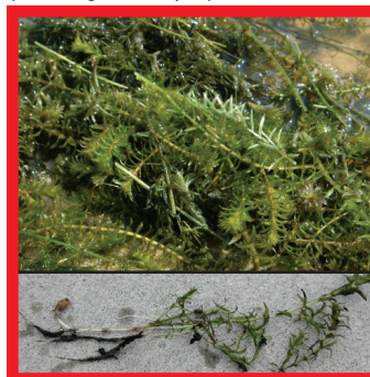
Hydrilla ( Hydrilla verticillata )