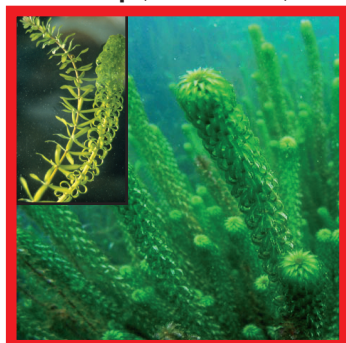
African elodea ( Lagarosiphon major )