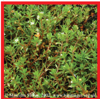
Australian swamp stonecrop ( Crassula helmsii )