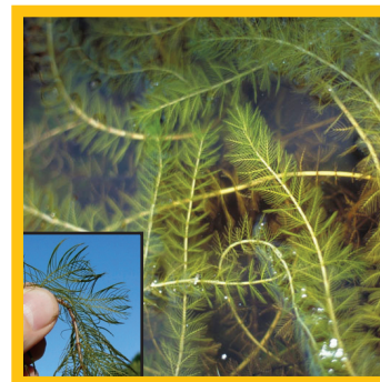
Eurasian water milfoil ( Myriophyllum spicatum )