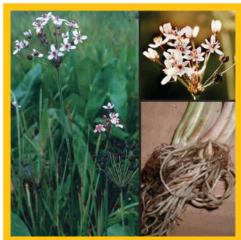
Flowering rush ( Butomus umbellatus )

http://dnr.wi.gov/invasives/aquatic/whattodo/