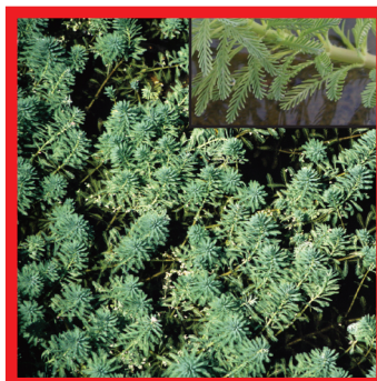
Parrot feather ( Myriophyllum aquaticum )