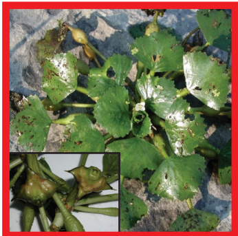
Water chestnut ( Trapa natans )