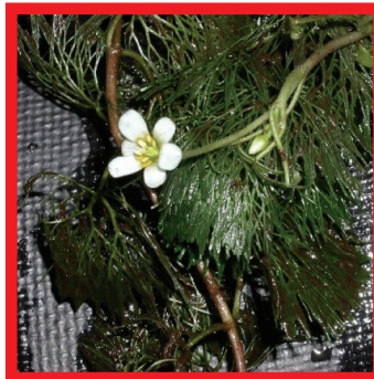
Fanwort ( Cabomba caroliniana )