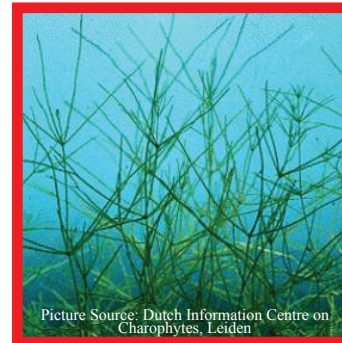
Starry stonewort (alga) ( Nitellopsis obtusa )