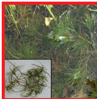
Brittle water nymph ( Najas minor )