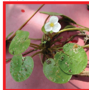
European frog-bit ( Hydrocharis morsus-ranae )