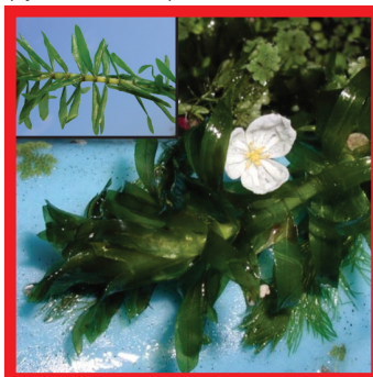
Brazilian waterweed ( Egeria densa )