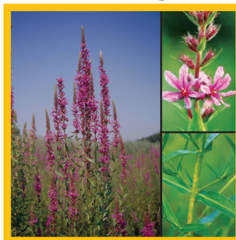
Purple loosestrife ( Lythrum salicaria )